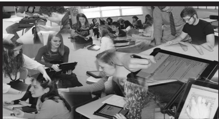
Woodford County Middle School NxGL Classrooms

learning modules with information, videos, and Prove-It quizzes. Before completing the Prove-It quiz, read all information and watch the videos presented. You may work on this little by little or all at once. Each Prove-It quiz requires a